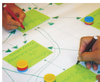
(ii) Placement of influence towers and drawing of 'smiley' faces to indicate stakeholder attitude to the project

Day 3: Developing the outcomes logic model and an M&E plan In the final part of the workshop, participants distil and integrate their cause-effect descriptions from the problem tree with the network view of project impact pathways into an outcomes logic model . This model describes in table format (see Table 1) how stakeholders (i.e. next users, end users, politically-important actors and project implementers) should act differently if the project is to achieve its vision. Each row describes changes in a particular actor's knowledge,