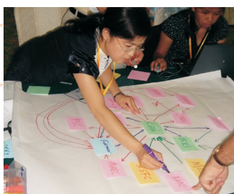
(i) Drawing a network map